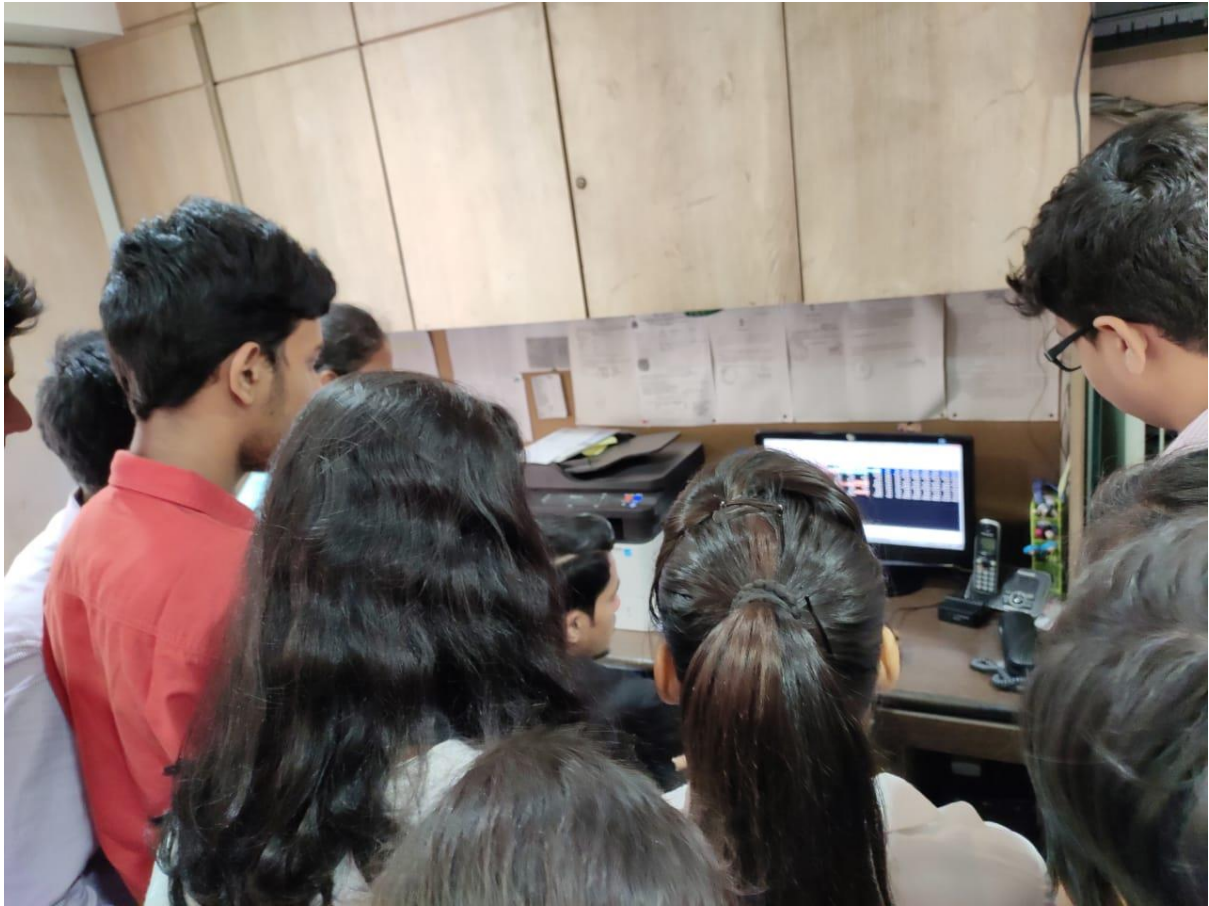
Students viewing the live screen at BSE.