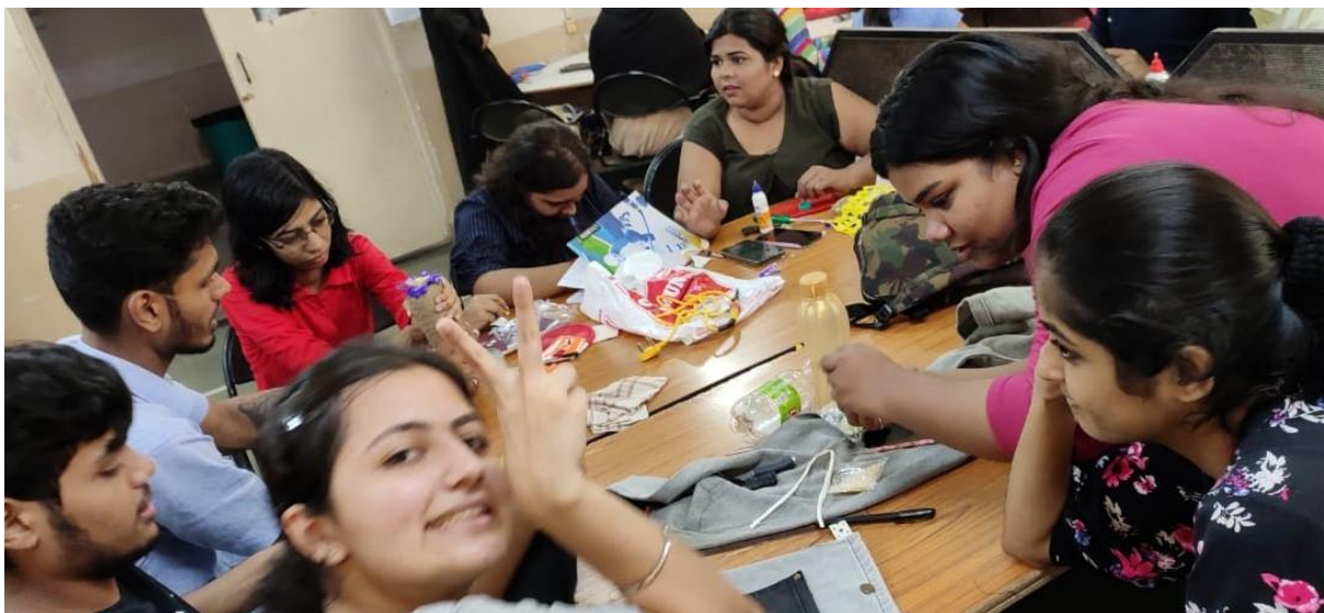
Image of Best Out of Waste conducted during E-Week