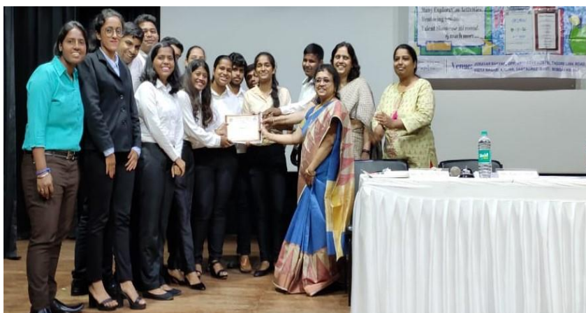
Photo of Prize Distribution

On the last day of the E-week a panel discussion on "Entrepreneurship a Journey of Empowerment through Ideas and Innovation was conducted". On the same day trophies and certificates were given away to the student winners and participants. This year E-cell set a benchmark by encouraging differently abled students to participate in the various competitions organised.